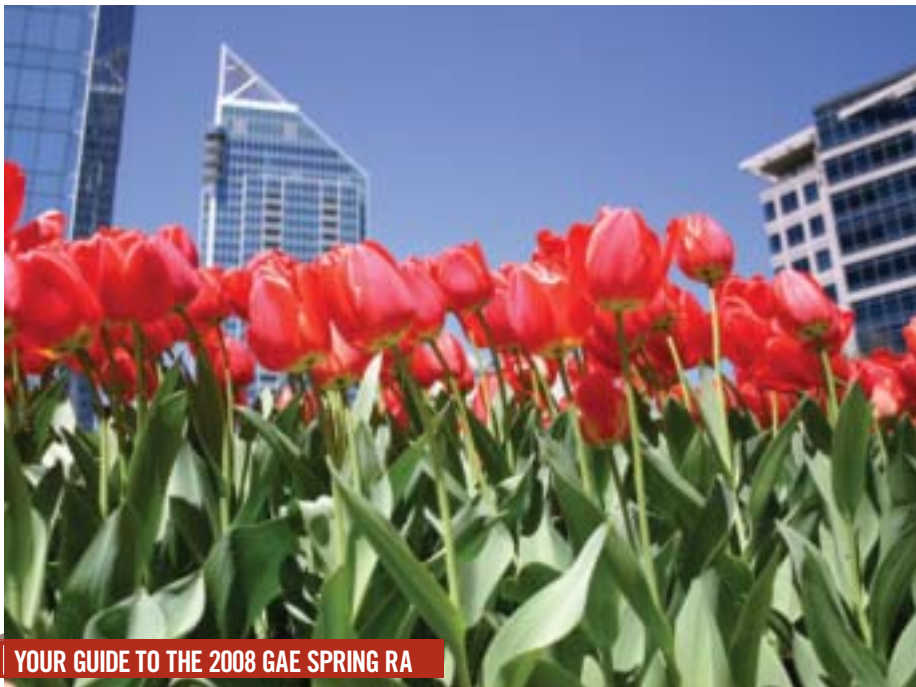
YOUR GUIDE TO THE 2008 GAE SPRING RA