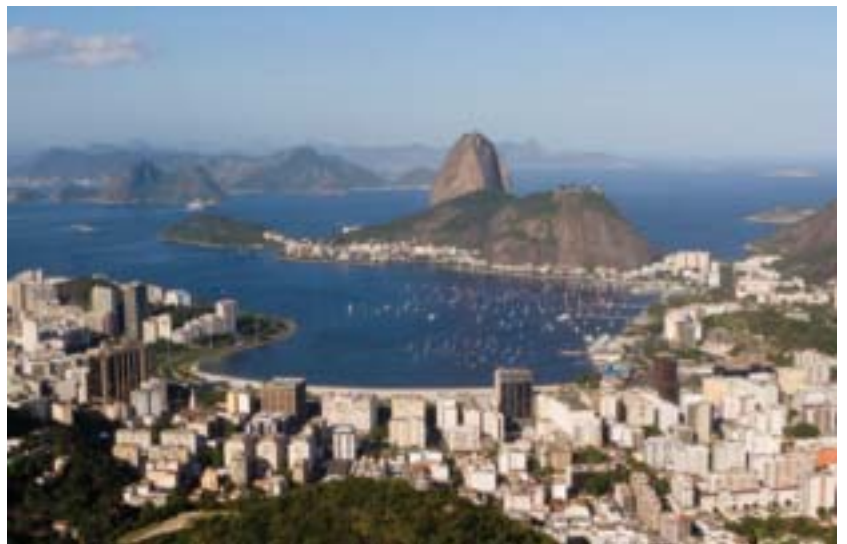
Rio de Janeiro and Sugar Loaf Mountain

The Fulbright Teacher Exchange Program of the U.S. Department of State is pleased to provide an opportunity for U.S. middle/high public school principals who have been recognized for their excellence, achievement and/or leadership as an educator on a local, regional or national level to learn more about the Brazilian educational system, visit Brazilian schools, and interact with Brazilian administrators, teachers, and students. Award-winning principals from more than 20 Brazilian states will join U.S. counterparts to share best practices in school leadership and administration, teacher development, and community involvement. U.S. principals will be paired with award-winning Brazilian administrators and travel to two different Brazilian states to visit various schools for one week of observation and work-shadowing. Award-winning principals from the 27 Brazilian states will join U.S. counterparts to share best practices in school leadership and management. At the end of their stay in Brazil, U.S. principals will be asked to make a presentation on their experience as administrators within the U.S. education system. Dates: August 2-16, 2008. To be eligible, you must be a principal or assistant principal of a public middle or high school who has been recognized on a local, regional, or national level for excellence, achievement, and/or leadership. Ability to understand Portuguese is not required. Knowledge of related languages such as French or Spanish will be viewed favorably.